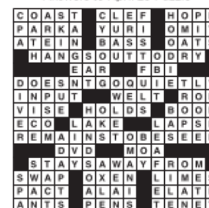
Answers to April 29 Puzzle