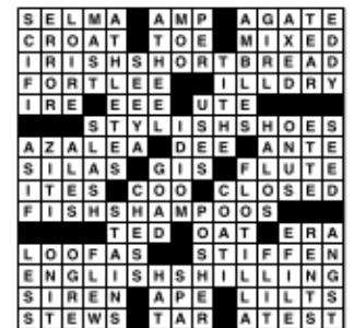
Answers to June 10 Puzzle