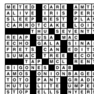
Answers to June 20 Puzzle