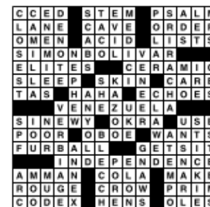
Answers to June 24 Puzzle