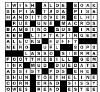
Answers to July 11 Puzzle