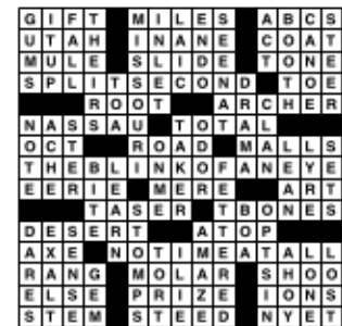
Answers to July 22 Puzzle