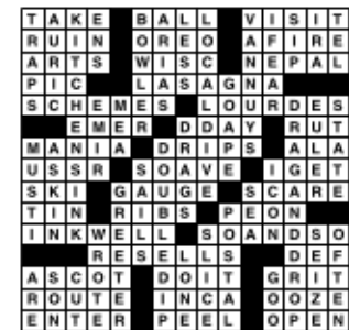
Answers to Nov. 24 Puzzle