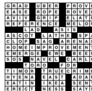
Answers to Nov. 25 Puzzle