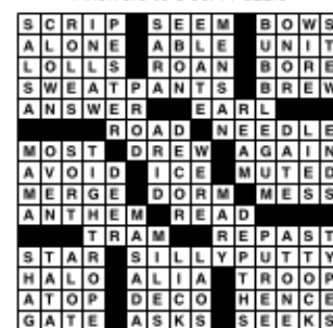
Answers to Dec. 1 Puzzle