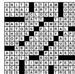
Answers to Dec. 5 Puzzle