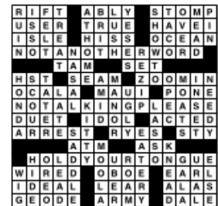
Answers to Dec. 29 Puzzle