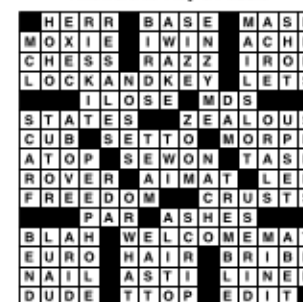
Answers to May 8 Puzzle