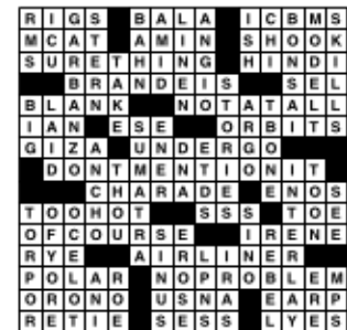
Answers to May 11 Puzzle